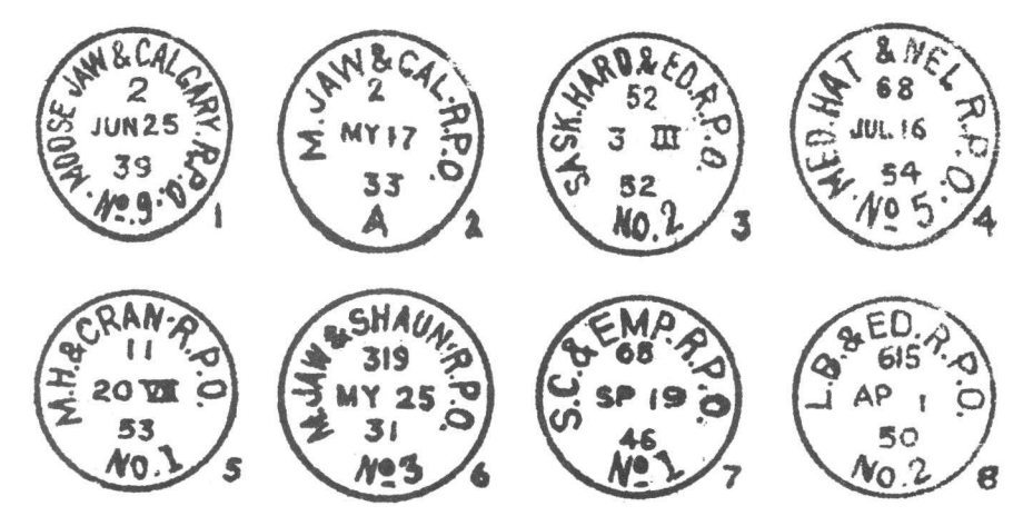
A. Moose Jaw-Swift Current-Medicine Hat-Calgary. (433 miles).

This final instalment deals with the Canadian Pacific lines from Moose Jaw and Saskatoon to Calgary, Edmonton and Nelson. The main lines were busy R.P.O. routes and long series of numbered hammers were issued.