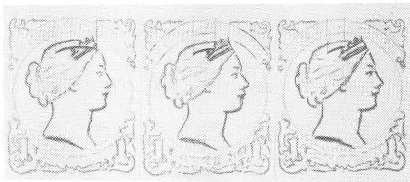
Long Strand Stage 1

I had to confess that while I had read the article some years ago, the argument put forward had at the time appeared to me to be so unconvincing that I had completely forgotten about it. One of my correspondents, who has all four varieties as described in the 'Topics' article, kindly offered to let me see them at Convention, and also went to the trouble of bringing along some blown-up photos for me to keep. This enabled me to reassess the matter and my conclusion is as follows :—