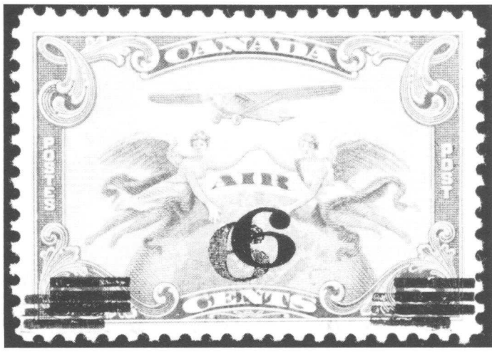
Forgery of the double overprint 6¢ on 5¢; Scott C3, SG313.

Authorities are on the lookout for the party circulating forged overprints of Scotts C3. Over 30 copies of the various invert and double and triple printings were disposed of in Seattle & Vancouver. The stamps are also marked as being sold and guaranteed by Stanley Gibbons, London, Eng. This guarantee is also a forgery. There would appear to be two different