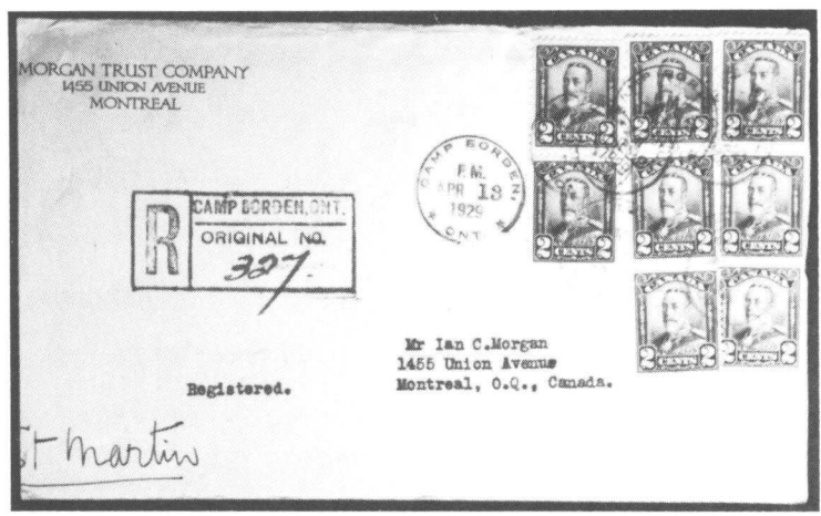
Scarce Camp Borden postmark, note stars flanking 'ONT'.

The writer is not aware of any other postmarks used at Camp Borden in the period "between the wars". If readers know of any would they please advise. The office which had opened in 1920 received a new designation, M.P.O. 202, on 25 April, 1940 at which time it was staffed by members of the Canadian Postal Corps.